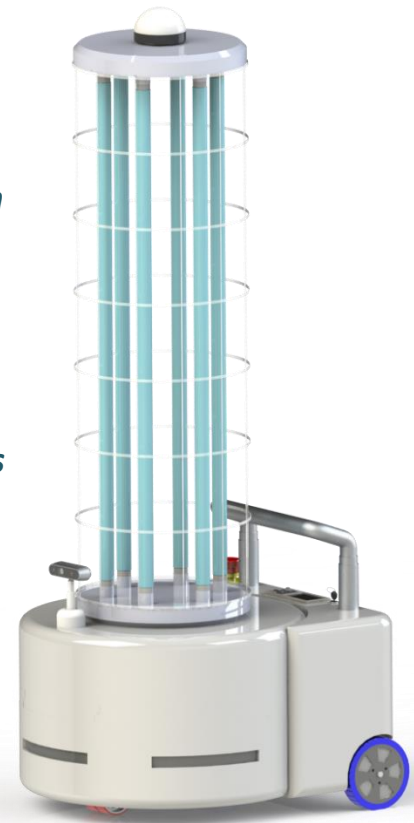
ROSAN22 base + UVC sanitation kit